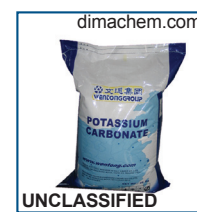
(U) Potassium carbonate.