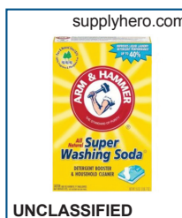
(U) Sodium carbonate.

(U//FOUO) Sodium cyanide can be produced using sodium carbonate (washing soda), charcoal, and ferric oxide.