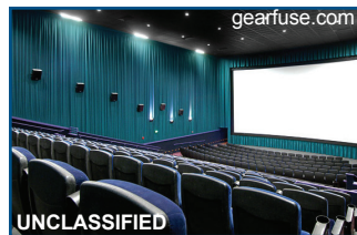
(U) Movie theater or auditorium.