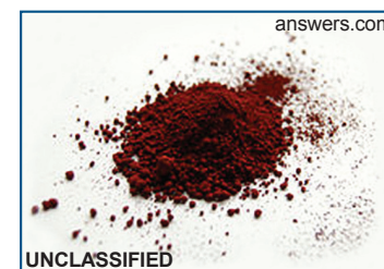
(U) Ferric oxide.