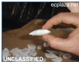
(U) Sodium cyanide briquette.