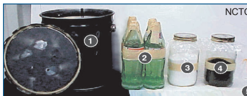
(U) Improvised chemical device.

(U//FOUO) An improvised chemical device, designed to release hydrogen cyanide gas by mixing several chemical components, could look like the device above, with all the components contained in a small vessel. This type of device would be most effective in a small enclosed space.