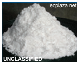
(U) Sodium cyanide powder.