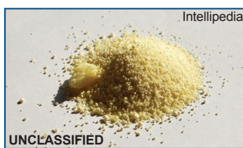
(U) Potassium ferrocyanide.

(U//FOUO) Potassium cyanide salt can be produced using potassium ferrocyanide and potassium carbonate.